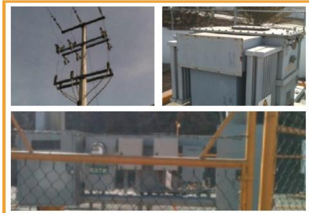
High voltage installations for Mining Grupo Mexico