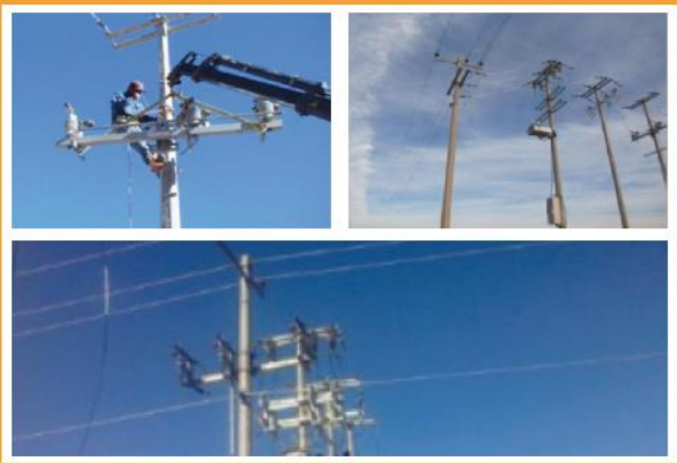
Engineering and scope for interconnection between Solar Farm built by Solarscape de Mexico and CFE