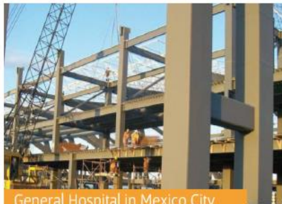
General Hospital in Mexico City