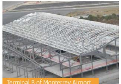
Terminal B of Monterrey Airport