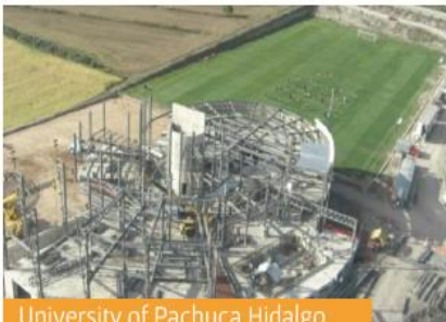
University of Pachuca Hidalgo