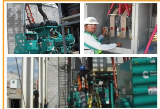
High voltage installations in Guaymas, Sonora