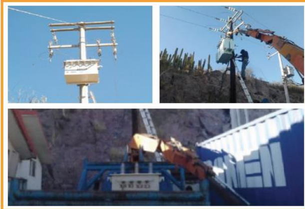
Maintenance to existing installations for Mine Multatos in Sonora