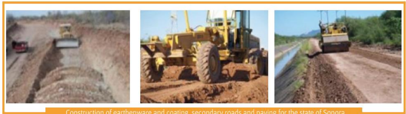
Construction of earthenware and coating, secondary roads and paving for the state of Sonora.